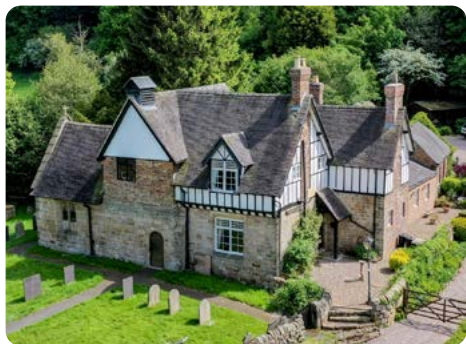
Dale Abbey Church